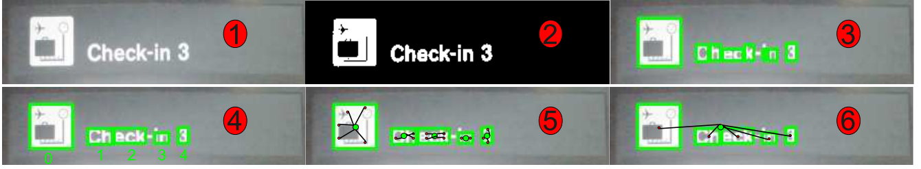
Fig. 1. Template processing. The input image 1 is binarized into image 2 with Otsu’s segmentation method. A region growing algorithm finds clusters of coherent colors in image 2 and outputs them in image 3. An agglomerative clustering algorithm groups the regions of image 3 into tokens in image 4. Image 5 shows the codebooks for each token of image 4. Image 6 shows the codebook for the entire sign from the tokens codebooks of image 4.